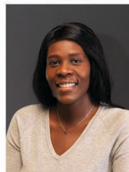
Awa Diop GPS: An Auto-Erotic Comedy