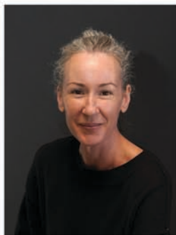
Tina Sterling Happy Trails - Masochism Tango